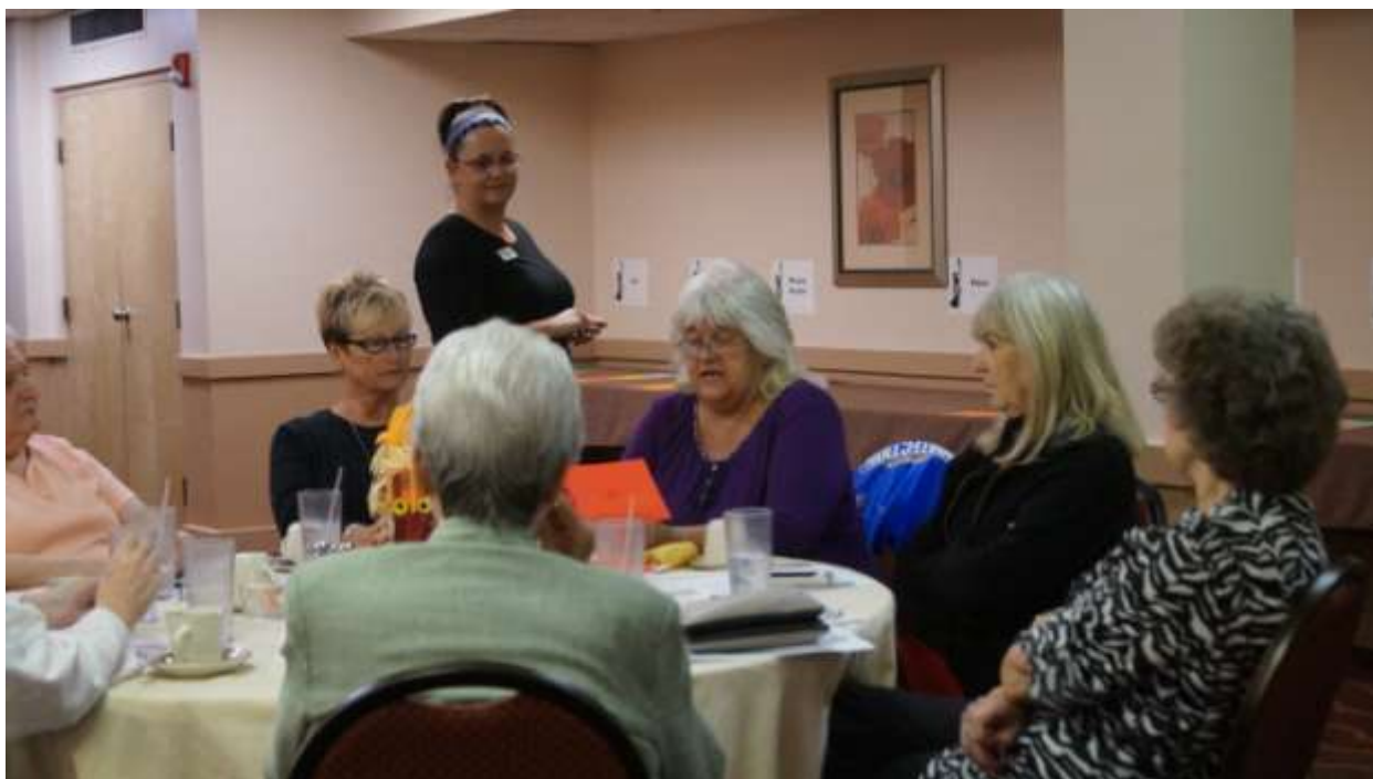
In Her Shoes Simulation

Members brought undergarments for CASA, and some of the “Pajama Kids” posed with some of the donations.