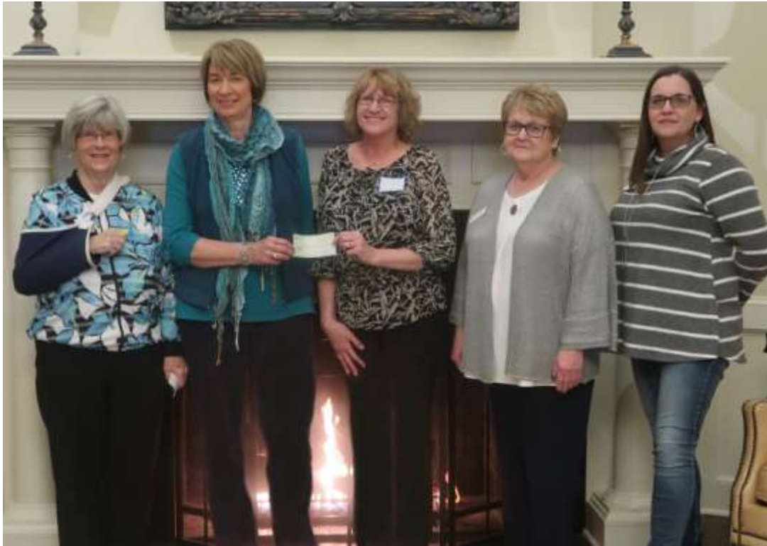
Meals on Wheels