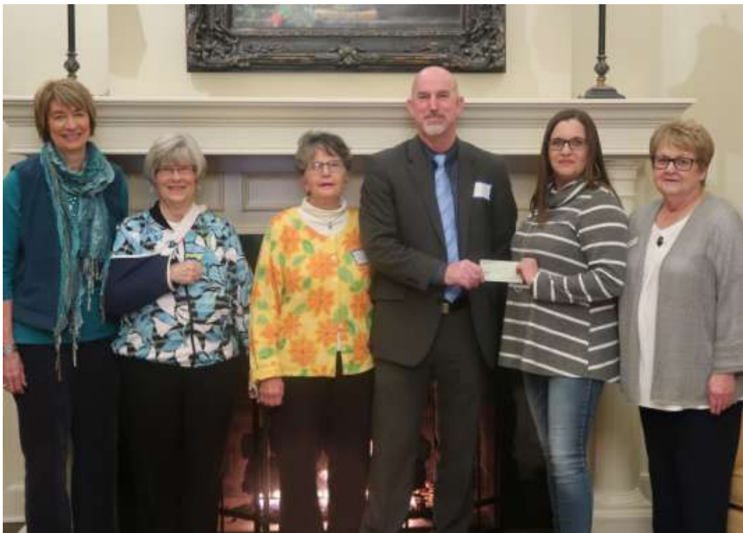
Sedalia School District