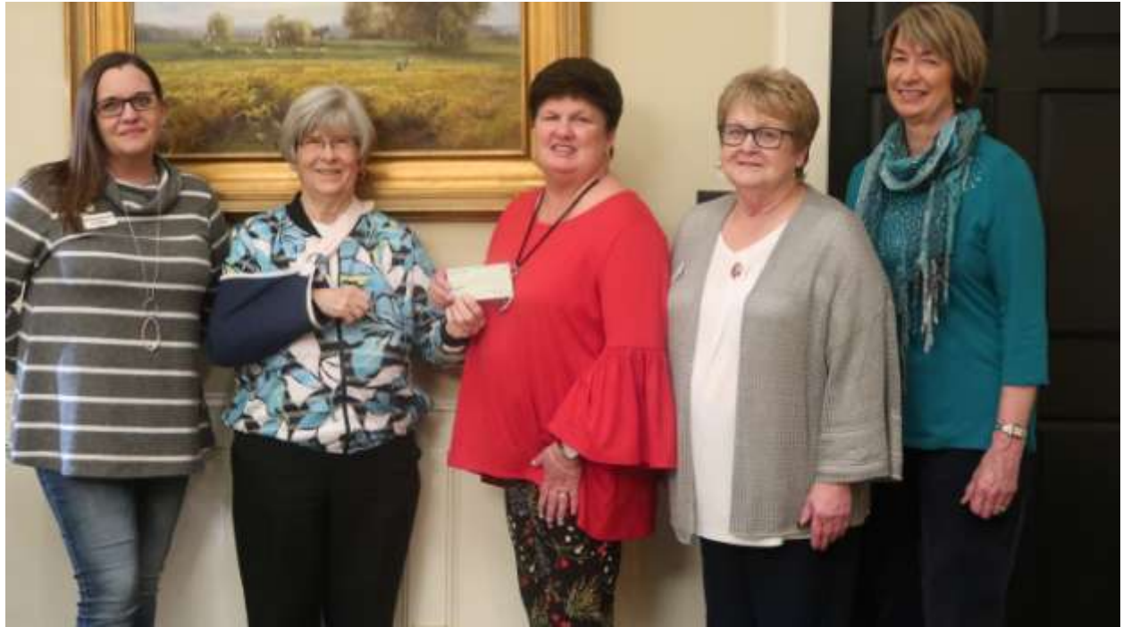
Activity Builders for Children