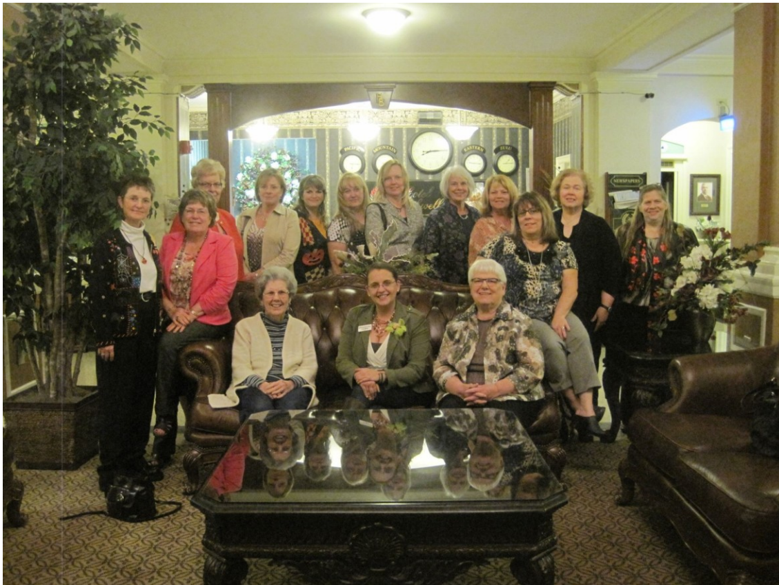
2014 Past President's Dinner at Ivory Grille