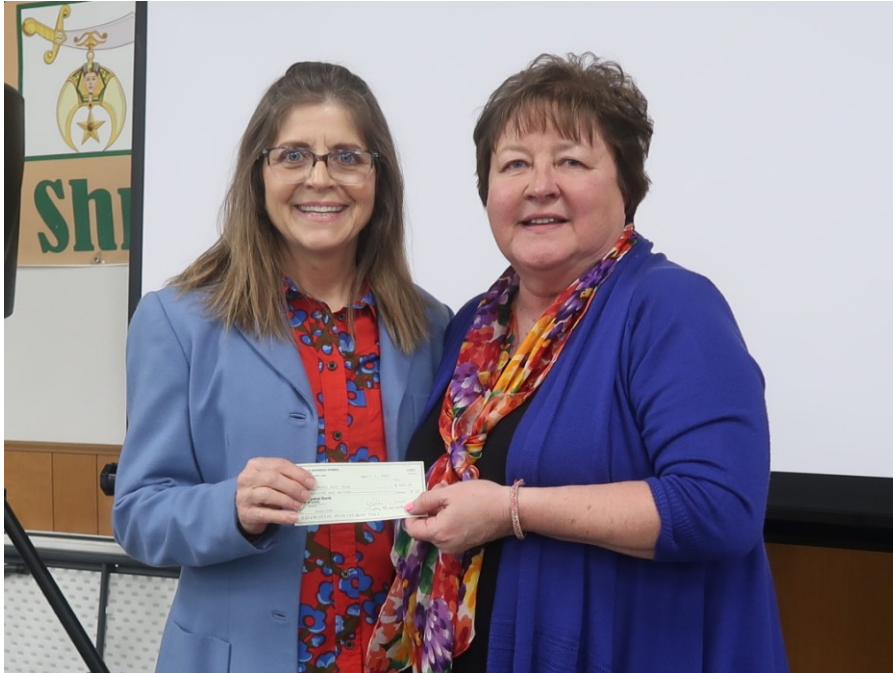
Mercy Rest Stop