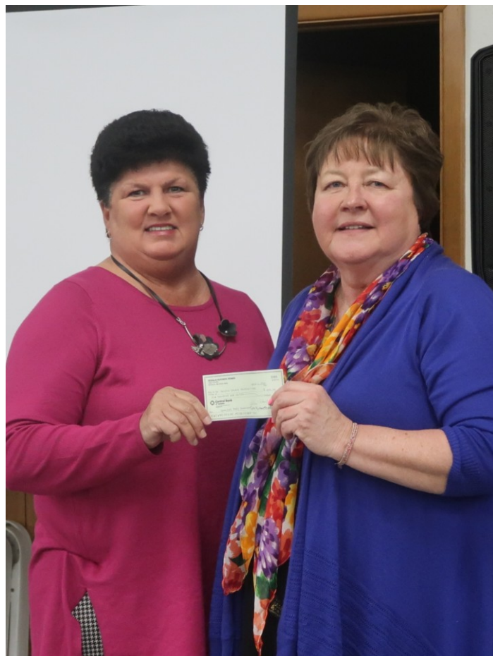
Pettis County Children's Fund