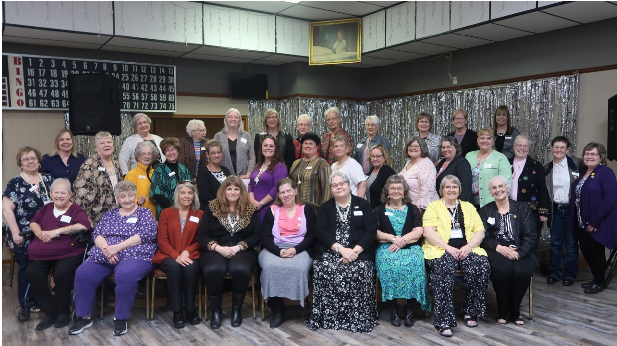
Attendees at the 2021 State Conference