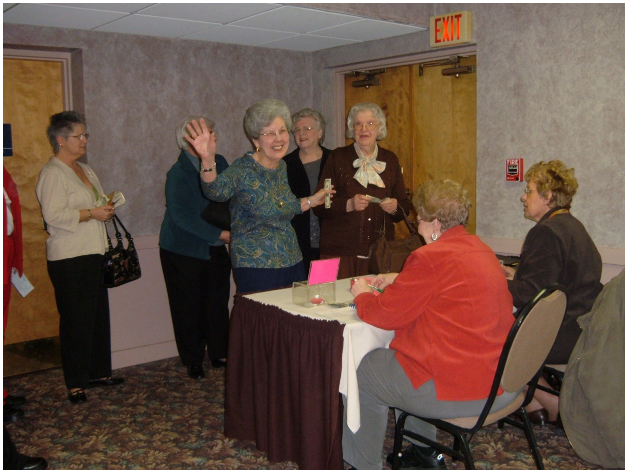
SBW Meeting 2009