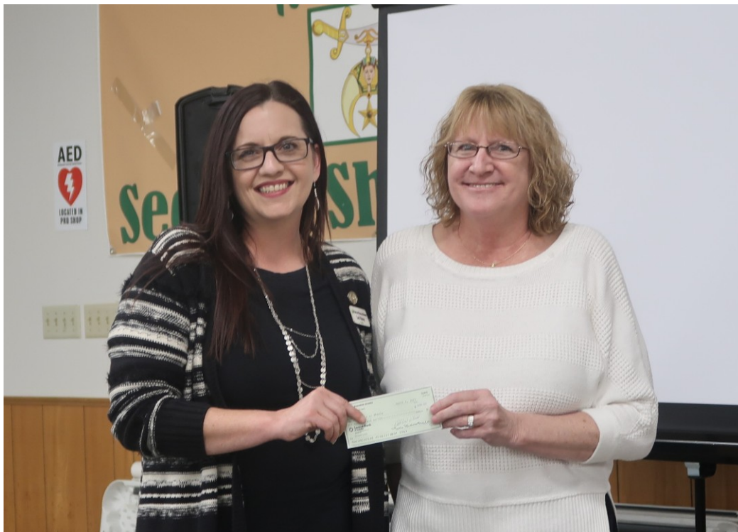
Meals on Wheels