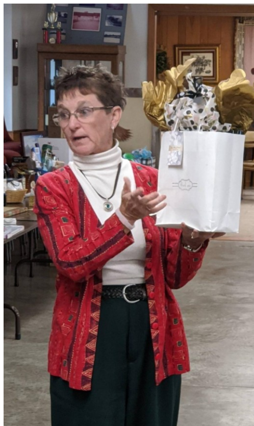
Some of the lucky winners!