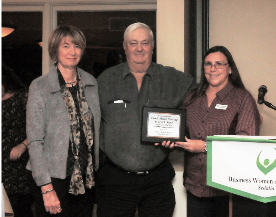
Don's Truck Towing, Business of the Year 2017