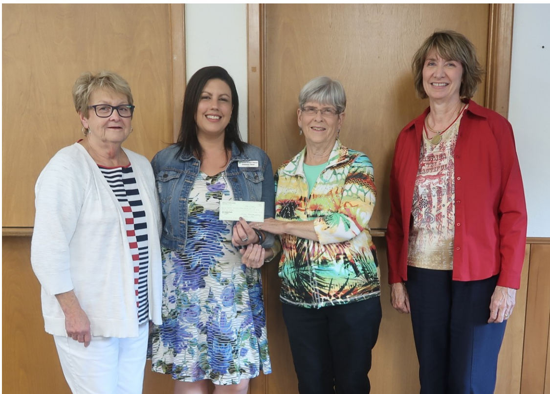
A check was presented to Open Door.