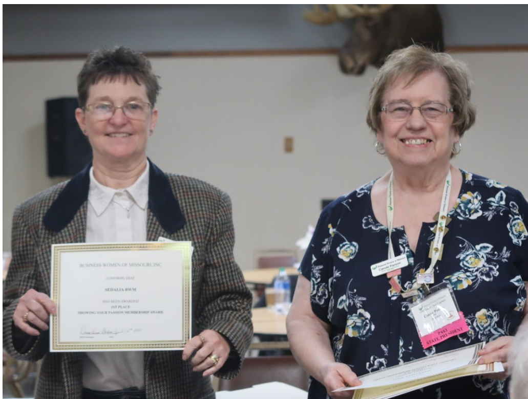
Sedalia received first place for membership