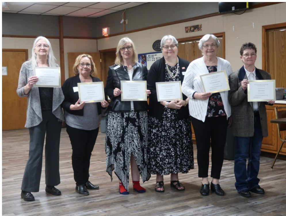
Sedalia received a bronze award for our contribution to foundation