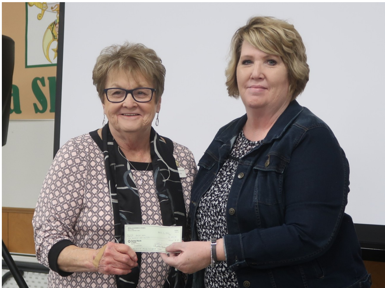
Child Safe of Missouri